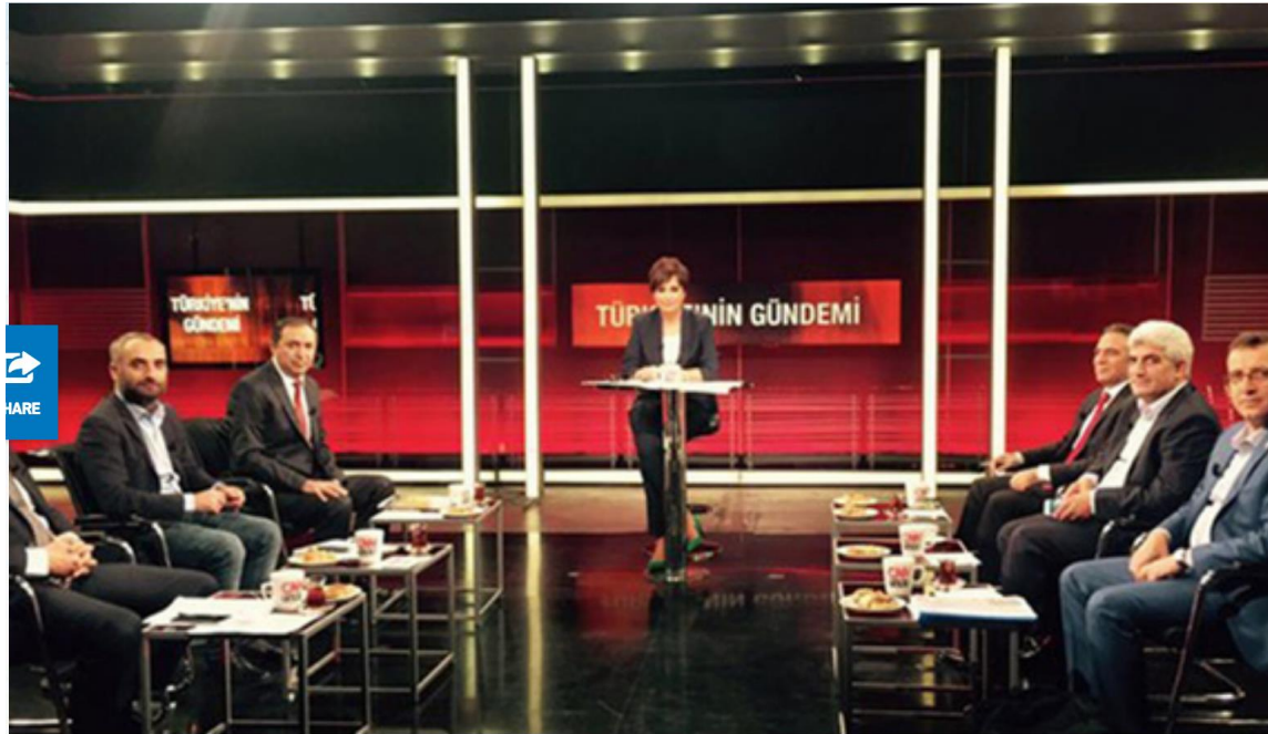
A panel on CNN Turk's current affairs show "Türkiye'nin Gündemi," Istanbul, Turkey, Sept. 4, 2016.